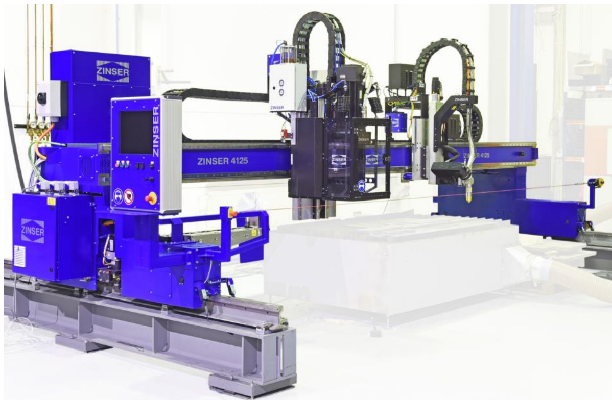
The ZINSEK 4125 can cope with most metalworking tasks.

Metalworking: Zinser opts for Kollmorgen servo technology in its CNC cutting center